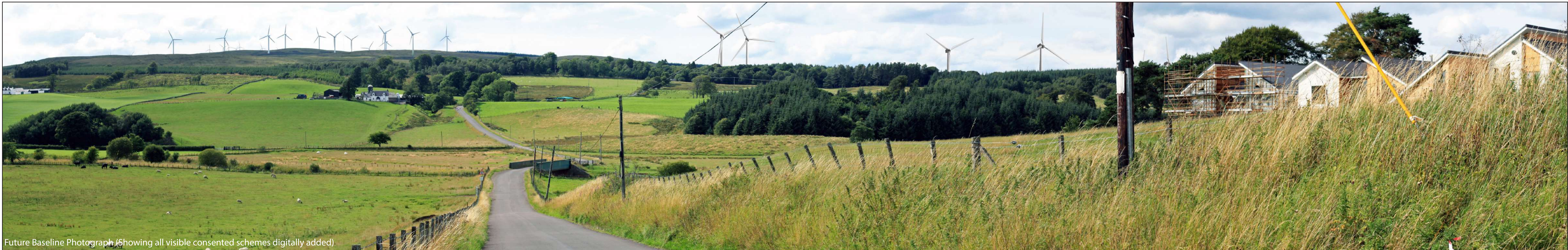
Future Baseline Photograph (Showing all visible consented schemes digitally added)