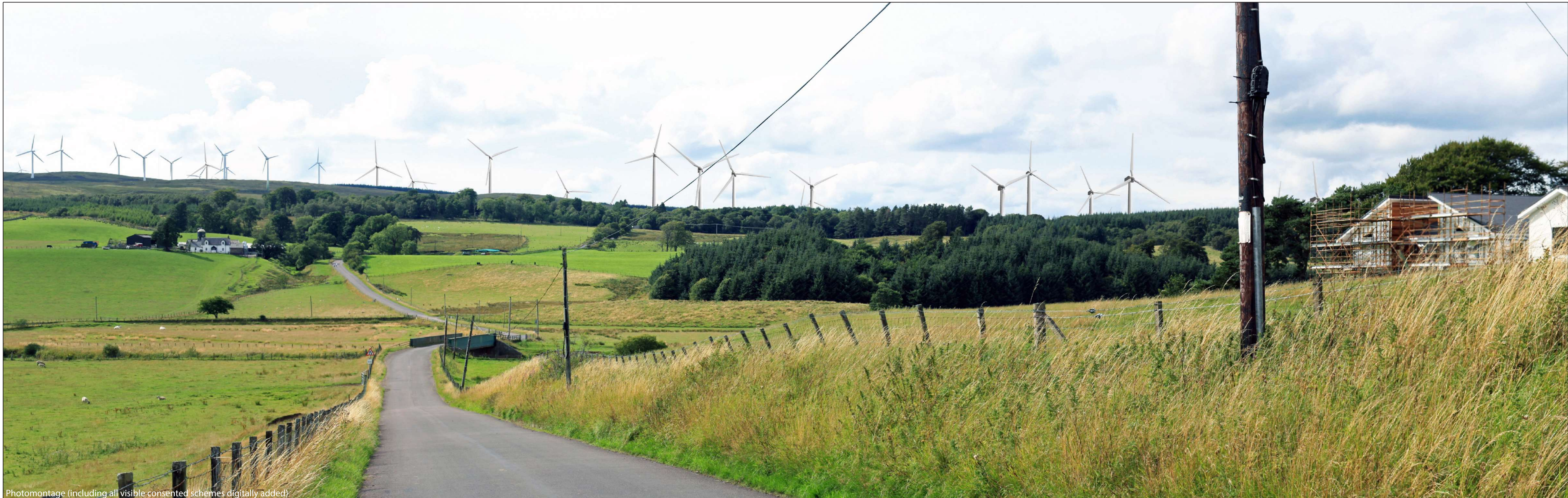
Photomontage (including all visible consented schemes digitally added)